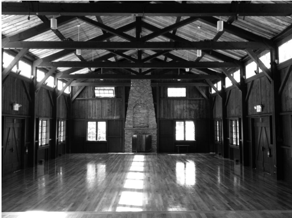
View from stage of main room